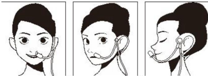
Right to wear earphone type oxygen inhalation device